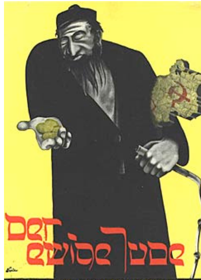
Text translation: "The Eternal Jew"

Discuss and respond to the following questions based on the above image in your group.